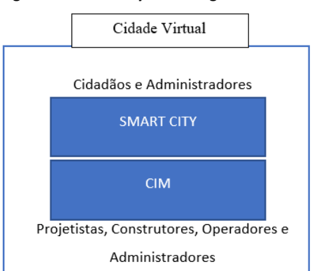
Figure 5 – Smart City-CIM integration model

ISSN eletrônico 2318-8472, volume 09, número 70, 2021