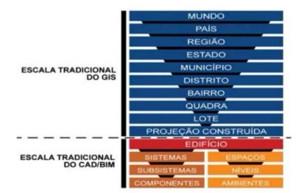
Figure 3 – Model of BIM-SIG Hierarchy

The interoperability between the BIM and SIG systems proved to be possible and promising to the cities' urban development. But, before that, it is important to understand the scales in which each technology operates in this context.