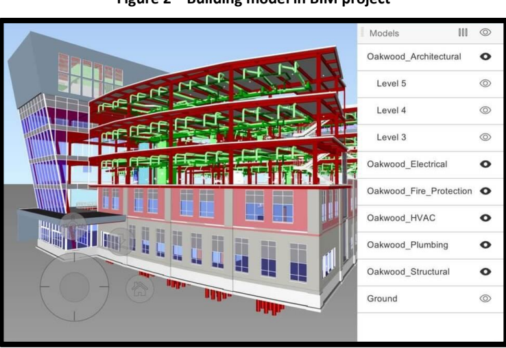
Figure 2 – Building model in BIM project