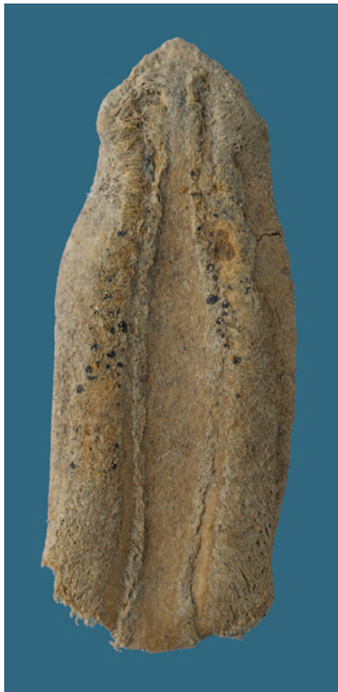
Fig. 2. A 1,000-year-old bottle gourd seed from Cold Oak Rock Shelter in Kentucky (age in calibrated calendar years: A.D. 760 \pm 40 , Beta-195535). The seed exhibits morphology typical of Asian landraces ( L. siceraria ssp. asiatica ) (8, 20): light grayish brown color, length/width ratio >2 , "ears" present (ear fragments partially broken off in photo, see Fig. 8), corky "wings" absent, and prominent and finely pubescent lines (seed length, 14.3 mm).

amplified were identical to the modern Asian reference group (Tables 3 and 4, which are published as supporting information on the PNAS web site). The single archaeological specimen included in the study that postdates European contact, however, corresponds to the modern African reference genotype for the three markers used. This postcontact rind fragment, recovered from Coxcatlan Cave and dated to ca. anno Domini (A.D.) 1660, more than a century after the establishment of Spanish settlements in the Tehuacan Valley (33), likely represents only one of many early European introductions of domesticated African bottle gourd into the Americas. After multiple early postcontact arrivals, African landraces apparently spread rapidly, and on the basis of DNA analysis of modern New World cultivars, today have almost completely replaced the Asian subspecies in the western hemisphere (34).