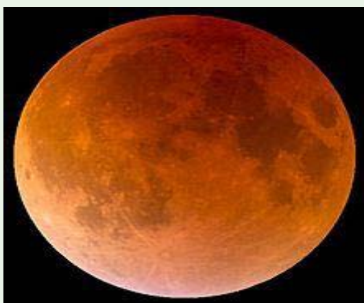
Figure 1: Photograph of full moon during the total lunar eclipse of 28 September 2015.

On Sleep: On earth the biology of life can be influenced by different factors like moon, tide, geographical cycle [15,16] There is a very good analysis that depicts that lunar cycle effect on not only sleep, but also some endogenous hormonal matter like melatonin level, cortisol level, Electroencephalogram activity (EEG), non Rapid Eye Movement sleep (NREM) [1,2]. They indicated that during full moon EEG activity decreased during NREM by 30% and time to fall asleep increases by 5 minutes. Ultimately sleep duration was reduced by 20 minutes.