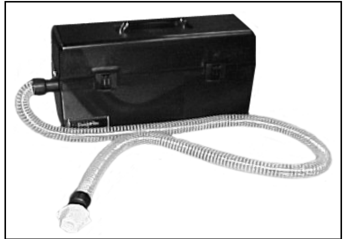
Figure 2. Photograph of HEPA vacuum cleaner and sock sample.

The HEPA vacuum sock samples were analyzed by an LRN contract laboratory. The HEPA vacuum socks and their