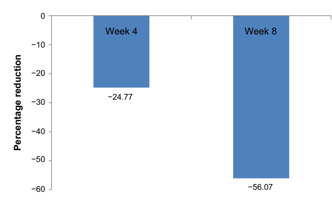
Figure 2 Percentage reduction in mMASI score from baseline. Abbreviation: mMASI, modified Melasma Area Severity Index.

Abbreviations: mMASI, modified Melasma Area Severity Index; SE, standard error.