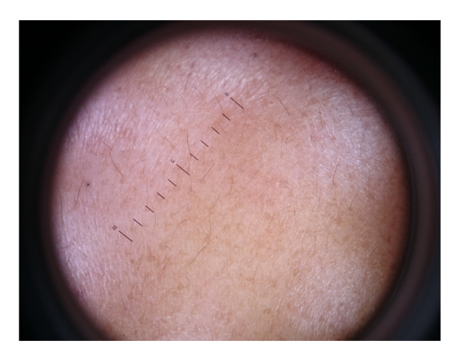
Figure 1 Dermoscopy of the study subject – representative image. Note: The dashed lines are the Dermoscope Instrument calibration.

reconfirmed by dermoscopic examination (Figure 1). Digital photographs were taken at baseline visit, intermediate visit at week 4, and subsequent visit at week 8. Along with this, the subjects' response to 4- n -butylresorcinol 0.3% cream and side effects were evaluated.