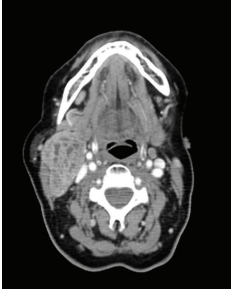
FIGURE 1: The neoplasm in lateral cervical region (maximum length of 6 cm) confirmed by CT scan.