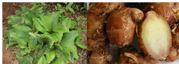
Figure 1. K. galanga . Leaves (left) and Rhizomes (right) (35).

The important compounds isolated from K. galanga extract are pentade cane, 3-carene, heptade cane, tetradecane, alpha gurjunene, cinnamaldehyde, 8-heptade cane, kaempferol, ethyl cinnamate, alpha terpineol, germacrene, cymene, beta-pinene, camphene, cyclooctene, kaempferide, gamma elemente, eucalyptol, 1-methyl-3-(1-methylethyl), 1,6-cyclodecadienen, beta-caryophyllen, cadinenes, delta limonene, borneol, alpha pinene, ethyl paramethoxycinnamate, 3,4-methoxyphenyl, 2-propeonic acid, and 1-methyl,2-(1-methylethyl) (Figure 2).