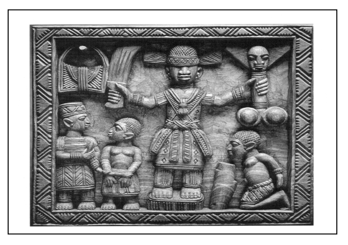
Fig 20, Lamidi Fakeye, Justice, Wood, 51 x 58cm, 1993, Courtesy of Lamidi Fakeye

Lamidi's themes in this period can best be described as expressions of cultural values and systems bounded by traditional religious formal lexicons. According to him while training in France, he was advised in not to jettison his African forms, especially as Nigerian independence was already gained, rather that he should incorporate African forms as an instrument for contemporary discourses. Within this insight, his themes and formalism retained Yoruba culture with interpretations revolving around contemporary issues. In "Woman with Bowl" for example (Fig. 18) African womanhood though seemingly acquiescent is expressed as an icon of society's nourishment, industriousness in dynamic multiple roles, the personification of beauty, epitome of peace and organized society and service to humanity. In "Justice" (fig 20), Lamidi laments the injustice associated with the annulment of June 12th, 1993 presidential election presumably won by Chief Mooshod Abiola by General Ibrahim Badamosi Babangida who was the Military Head of State at that time. In the work, an attempt was made at using cultural and religious elements associated with Sango worship as an instrument for defining the concept.