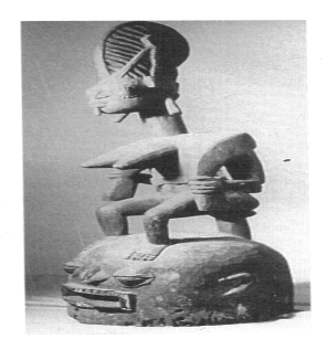
Fig 4: (4th Generation), FakeyeAkobi-Ogun, Epa Mask, Wood c.1935, Ht. 92cm