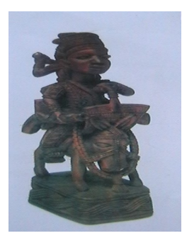
Fig 5: (5th Generation), LamidiFakeye, Warrior (JagunJagun), Wood, Ht. 45cm, 2005