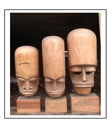
Fig 7: (7th Generation) Sola Fakeye, Mask, Wood, 46cm, 2008