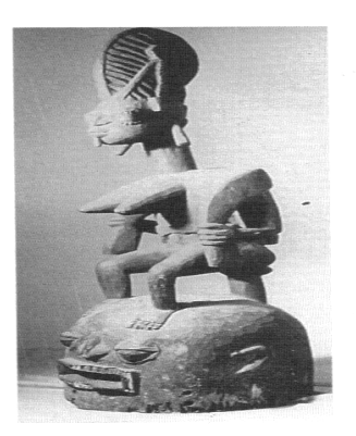
Fig 10: Fakeye Akobi-Ogun, head Mask, Wood, c.1935, Ht. 92cm, Courtesy, National Museum, Lagos

In the late 1930s, when Lamidi's practice began, traditional Yoruba Orisa worship systems were still prominent. Christianity and Islam were relatively new and had not taken root in the Igbomina/ Ekiti regions. Wood carvings of revered traditional Pantheons were the objects and symbols of worship and veneration. John Pemberton III: 1977, has identified the role sacred symbols played in Igbomina society. Under such socio-religious system Lamidi's works Omolangidi (doll), Ere Ibeji (Twin figures) found thematic definition and patronage.