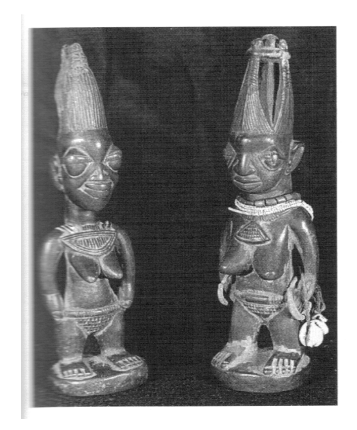
Fig 2: (2nd Generation), Bagunjooko, Wood, Ht. 28cm, c. 1850