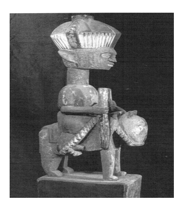
Fig 9: Lamidi Fakeye, Horse Rider, Wood, t.33cm, c.1945, Courtesy, Lamidi Fakeye

Photographic data of Lamidi's earliest works in this period may not be available, but his "Horse Rider" Fig 9 produced in c. 1945 provides some impetus to his level of development at that time. The piece presents a frontal statuette of an equestrian. The work's formal character, though exploring some spatial relation is mathematically set in a tight right-angle composition bereft of dynamic posture. The emphasis on the head and gear, elongated neck and sit tight orientation with diminutive legs, no doubt, is a relatively bold step of a young wood carver aping his father's EPA (fig 4) which bears the same human formalism over a helmet mask.