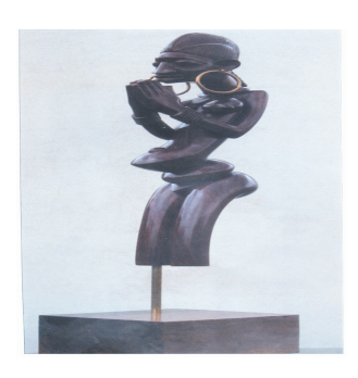
Fig 6: (6th Generation), Olabisi Fakeye, Adura Lo N Gba-AgbaraKo, Wood, Ht. 102cm, 2003, Courtesy, Olabisi Fakeye