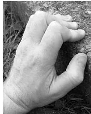
Figure 3 The cling grip.

Many climbers use a number of standard handholds, although other less conventional holds are often applied. Handholds in rock climbing generate large forces in the flexor digitorum profundus and superficialis tendons and the