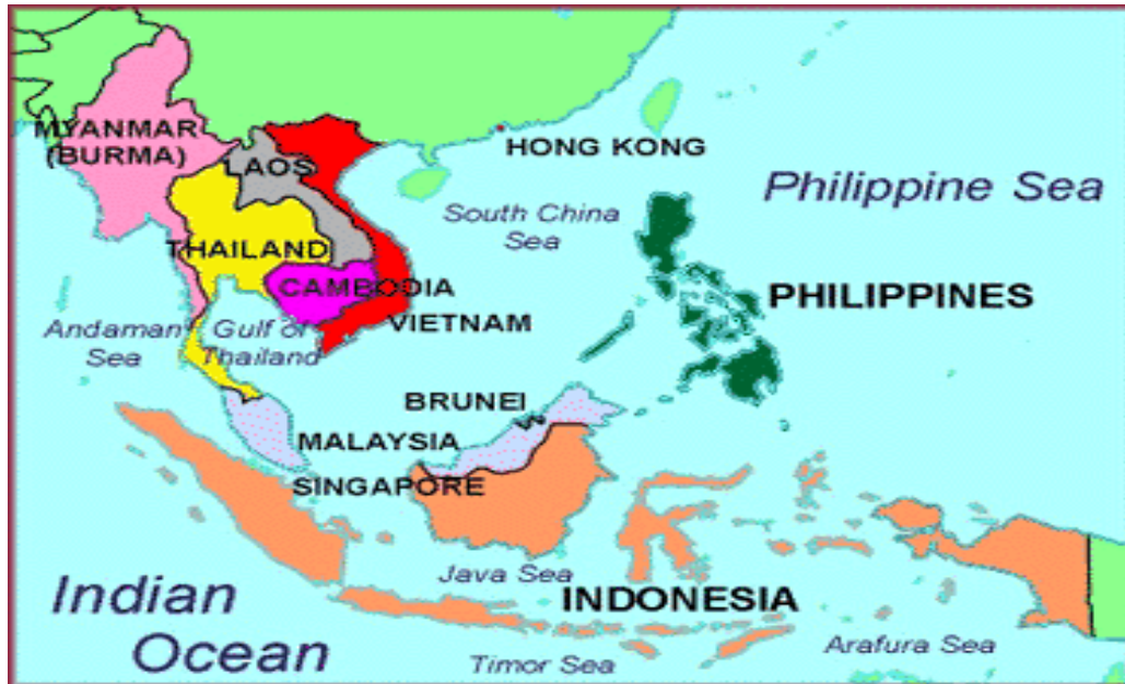
Figure 1. The Southeast Asia Region.

and multi-religious. The total population of the region is approximately 500 million 22 . All the Southeast Asia states, except for Thailand, have one thing in common: they were at one time a colony of at least one western power.