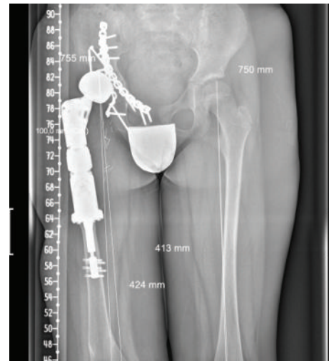
FIGURE 3: After 18 months of follow-up, a plain AP radiograph of the pelvis shows correct integration of the autograft and prosthesis.

Endoprosthetic replacement following tumor resection is a good treatment option for proximal femoral malignant lesions, due to its low complication rate and good postoperative function [4, 6]; however, the management of a proximal femoral malignant lesion with intra-articular involvement is challenging, especially in pediatric patients. The resection of a tumor at the level of the proximal femur results in loss of abductors and other musculature necessary for hip stability. This often leads to a higher dislocation rate. Hip dislocation is a recognized problem after the use of megaprotheses, with rates of dislocation varying from 1.7% to around 28% [4, 7, 8]. To reduce the risk of dislocation in our case, we decided to use a bipolar hemiarthroplasty as it is inherently more stable than total hip replacement. We reattached the abductors to a surgical mesh and directly to the prosthesis attachment site.