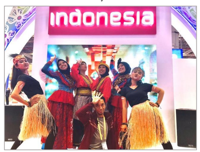
Fig. 2. The contingent of Indonesian dancers in the China International Import Expo