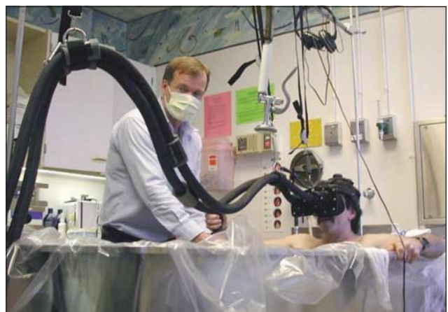
A patient's attention is taken up with "SnowWorld" via a water-friendly virtual reality helmet during wound care in the hydrotub