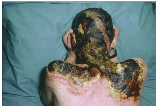
With the increased survival of patients with large burns, there is increased focus on the psychological challenges and recovery that such patients must face

Depression and anxiety —Symptoms of depression and anxiety are common and start to appear in the acute phase of recovery. Acute stress disorder (occurs in the first month) and post-traumatic stress disorder (occurs after one month) are more common after burns than other forms of injury. Patients with these disorders typically have larger burns and more severe pain and express more guilt about the precipitating event. The severity of depression is correlated with a patient's level of resting pain and level of social support.