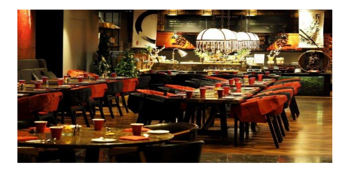
Figure 1. Restaurant businesses