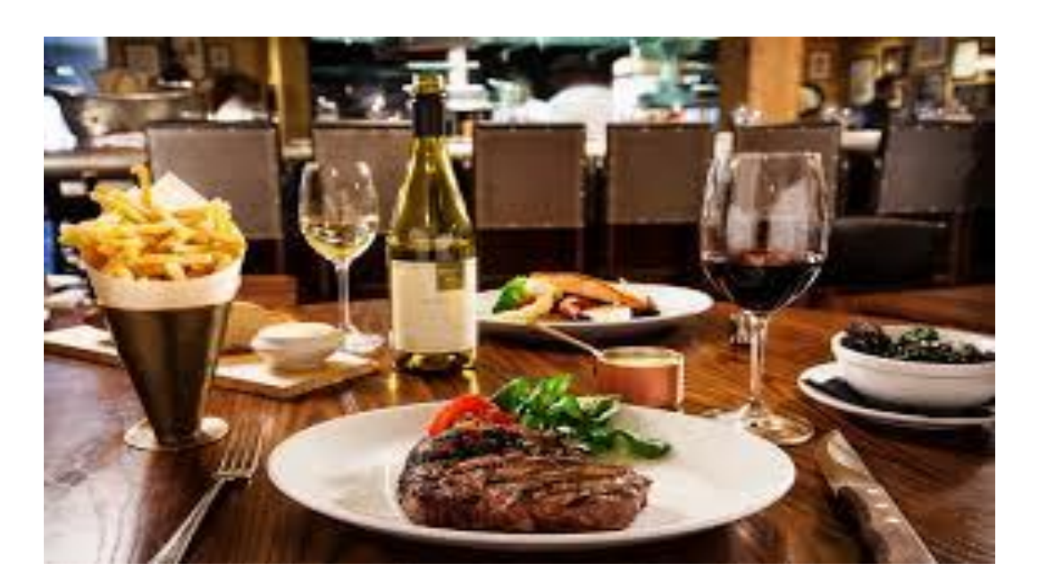
Figure 2. Restaurant businesses Source: (https://lifestyle.okezone.com/2020)