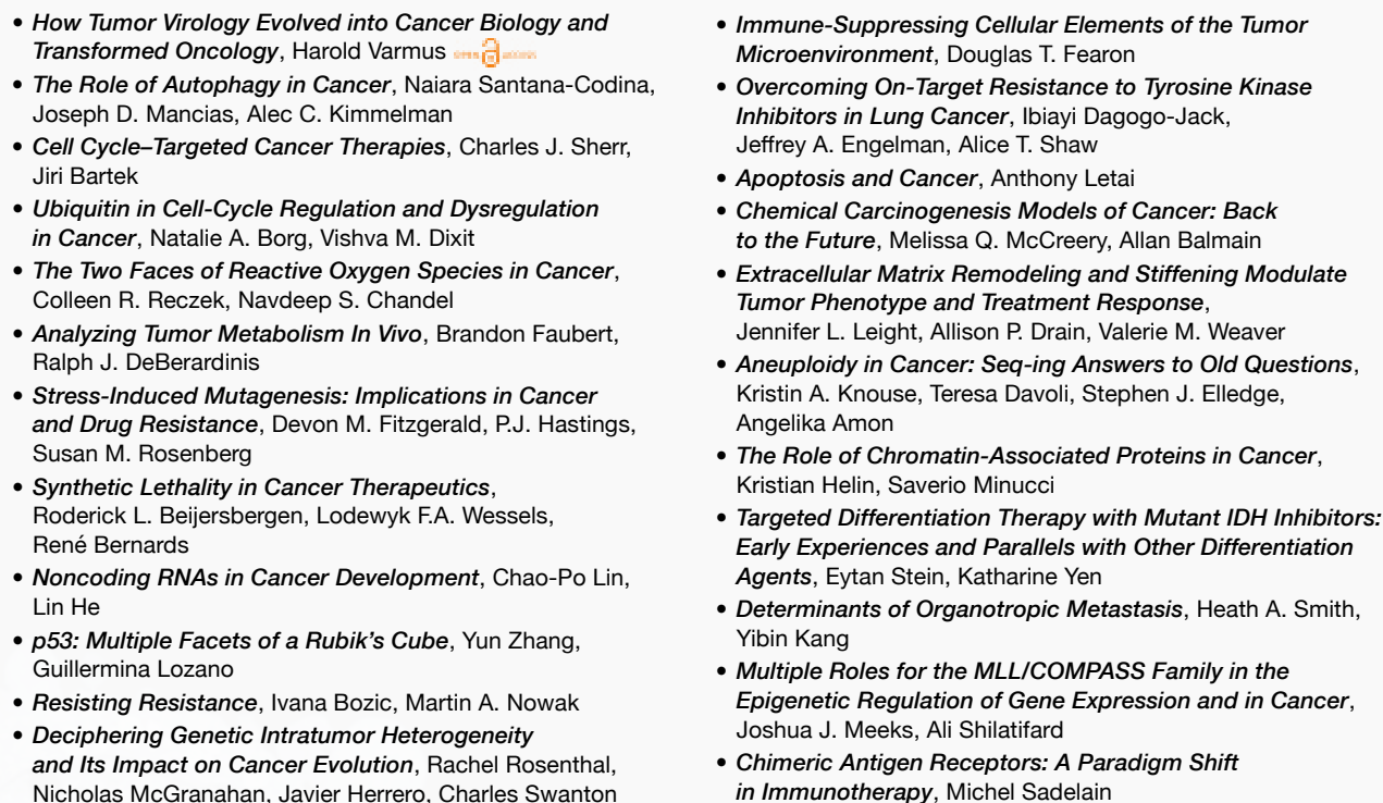
TABLE OF CONTENTS FOR VOLUME 1:

Annu. Rev. Clin. Psychol. 2016.12:105-132. Downloaded from www.annualreviews.org. Access provided by University of Michigan - Ann Arbor on 01/14/18. For personal use only.