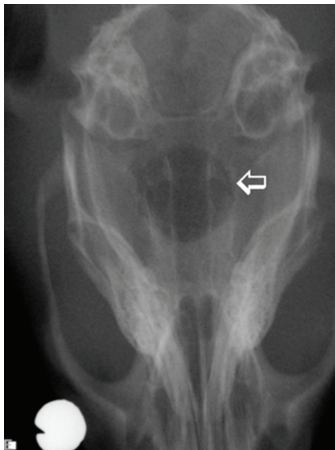
Figure 1. Radiographic aspect of the 8 mm critical size bone defect (CSBD) made in rats calvaria (→).

The radiographic bone density in the defects was determined by the analysis of gray levels inside the CSBD, in an area containing, in average, 35.000 pixels. This area was selected since it represented the full area of a 8-mm (in diameter) circular area, determining that the whole defect would be assessed, in all cases, standardizing the region that was measured. This analysis was