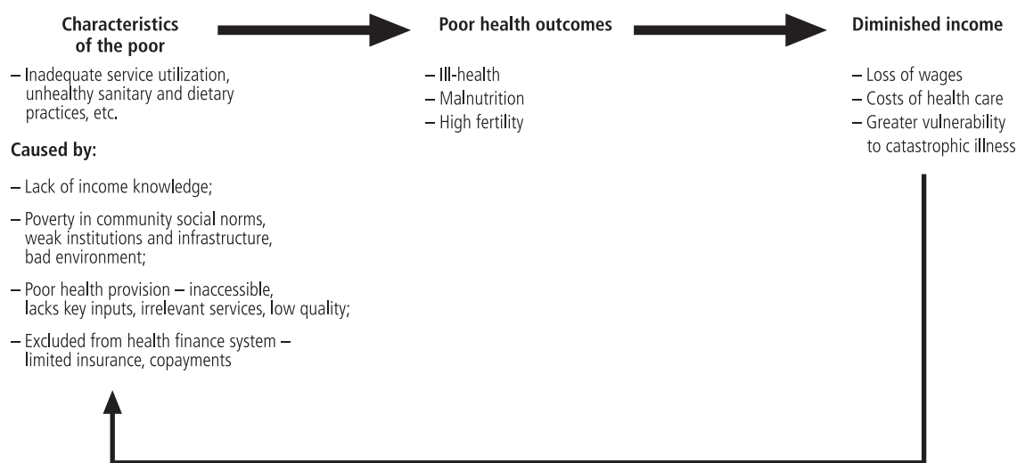
Fig. 1. Cycle of health and poverty

people from such loss goes beyond the area of health policy as currently interpreted. Nevertheless, it should be noted that lost income is probably a larger cause of impoverishment than out-of-pocket payments for health services (25). The evidence on health inequalities and impoverishment is discussed, together with the factors driving the results and the effectiveness of policies in these areas.