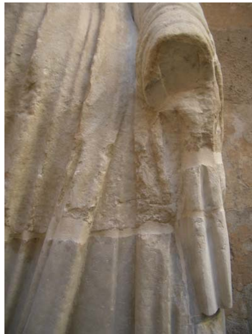
Fig. 4. The statue seen in profile, detail. Notice the flat figure and the insertions at the figure's left arm. At the upper part of the arm is an area of a missing fragment revealing toolmarks of an earlier integration.