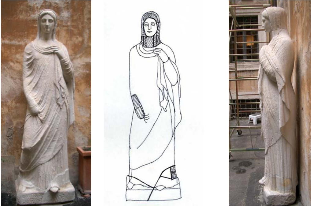
Fig. 6. The statue of “SEMPRONIA” seen from the front and in profile.