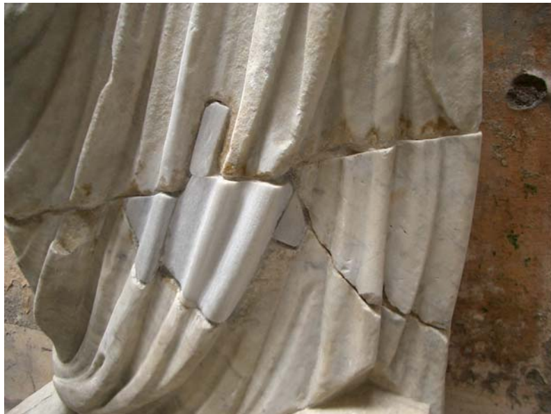
Fig. 12. The head of Cassius. Integrations of different kinds of marble and stucco. Photo: A. Freccero. Fig. 13. Assemblage of marbles fragments at the level of the feet. Photo: A. Freccero.