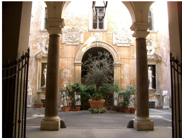
Fig.1. Palazzo Lancellotti courtyard. The west wall.

Four statues, three togati and one palliat a placed on the ground at regular intervals along the west wall in the courtyard, are the focus of this study. 1 The statues are 17 th century creations in white marble that include at least one large fragment of a Roman original with later additions. Modern inscriptions associate the togati with famous Roman citizens while the inscription on the base of the palliat a may be antique. These works of art were not part of the original 17 th century setting in the palace. Incorporated in the Lancellotti collection at the beginning of the 19 th century, they were kept in storage until around 1970 when they were finally exhibited along the west wall of the courtyard. The original function of this kind of Roman portrait and its role in 17 th century settings and the present display are discussed.