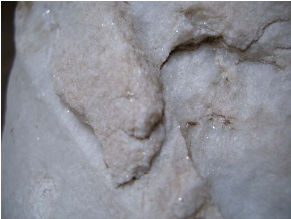
Fig. 18. Marble. Above : tool marks. Below : Sugaring large-grained marble.