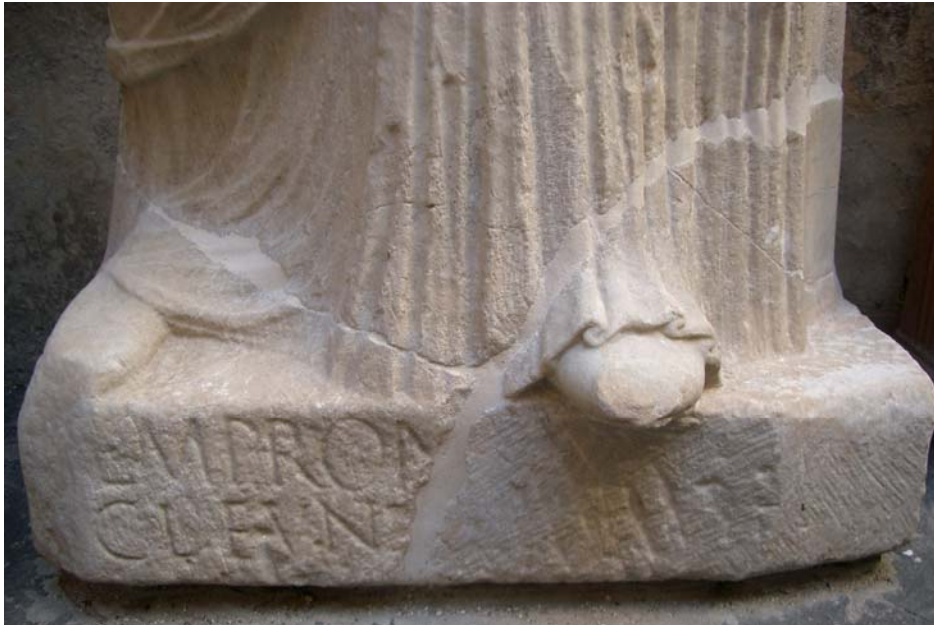
Fig. 8. The two fragments of the base.

In conclusion, I suggest this is the remaining left side of a re-worked Roman group portrait. Divided into two or more portraits, the palliata became a statue in the round. Given a new face that does not fit conventions related to this type of statue, the figure may be considered as a piece of art of the 18 th century. Possibly the statue was part of the Ginetti collection. The erasing of the inscription on base fragment b was probably made in the 20 th century, due to a breakage when the statue was placed in the Lancellotti courtyard.