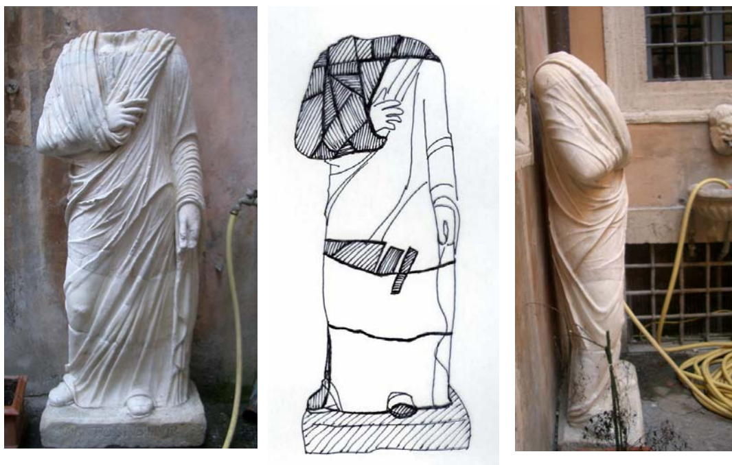
Fig. 14. The statue of “M ANTONIVS III VIR”, front, and profile.

Bibliography: Galleria Giustiniana , I. fig. 110. Matz, von Duhn 1881, Antike Bildwerke in Rom , vol.I; no. 1213.