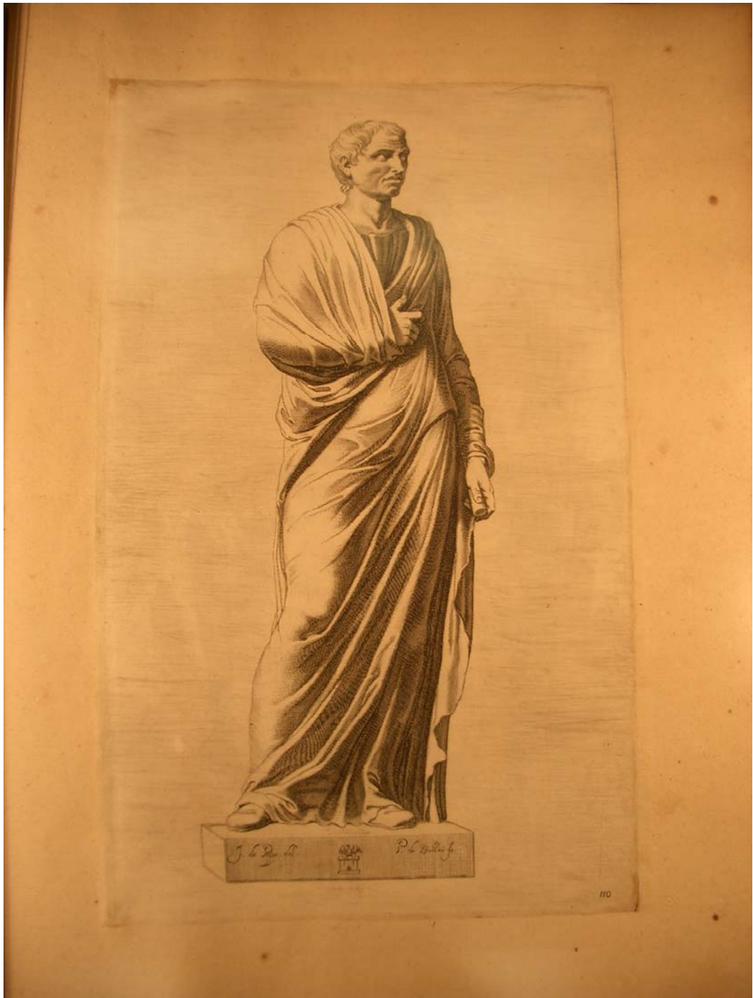
Fig. 19. M. Antonius III VIR, engraving. From the Galleria Giustiniana .