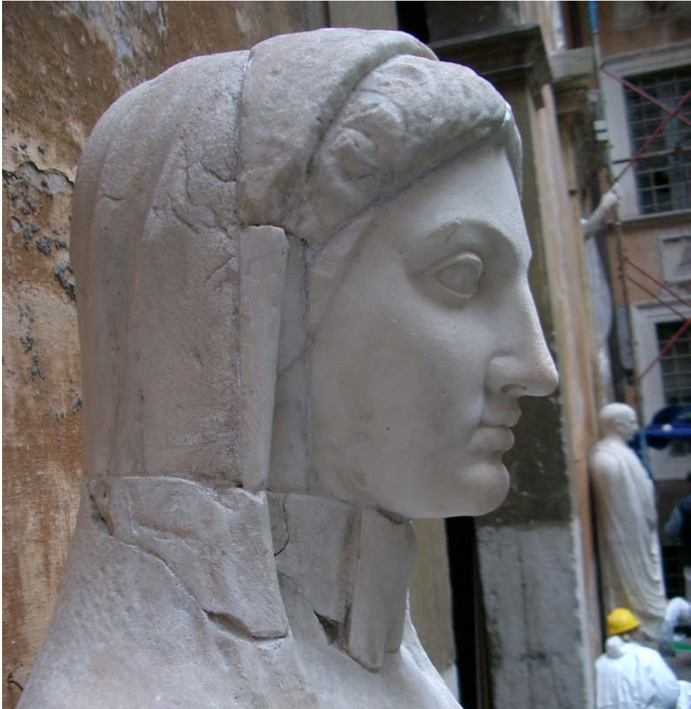
Fig. 9. Fragments of the head and neck.