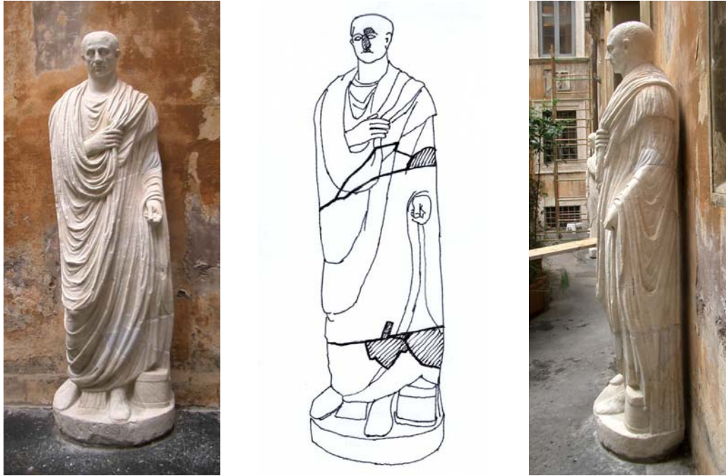
Fig. 10. The statue of “C. CASSIVS”. Front and in profile.

Bibliography: Matz, von Duhn 1881, Antike Bildwerke in Rom, vol.I ; Gallottini 1998, Le sculture della Collezione Giustiniani; Galleria Giustiniana , n. 668 (1638).