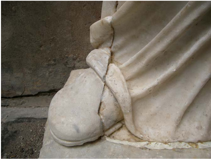
Fig. 16. Assemblage of marble fragments at the sling of the toga. After conservation. Photo: A. Freccero. Fig. 17. The reconstructed right foot. During conservation. Photo: A. Freccero.