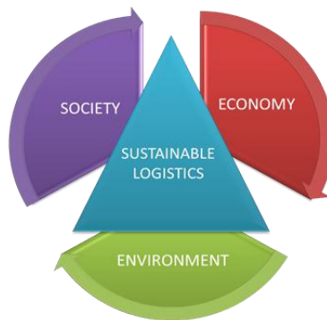
Fig. 2 Upgrading processes can result in logistics conceived as sustainable

Foundation of sustainable logistics is green logistics that includes greening the processes of all parts of supply chain. Creation of sustainable processes inside manufacturing, manipulation, transport, packaging, etc. will ensure greening the supply chain.