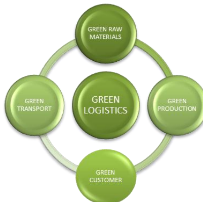
Fig. 1 Collection of some supply chain activities that need to be strategically planned to create green supply chain

Designing a green supply chain implicates an collection of organized activities (as shown in figure 1.) made to result as a foundation for a sustainable and upgradable green network that consist of planning the green production, green transport, waste reduction, energy savings, space savings, resource savings, planning a green supply chain management and having a green consumer. Green logistics is defined by five categories, including city logistics, reverse logistics, reducing freight transport externalities, green supply chain management and logistics in corporate environmental strategies. 3