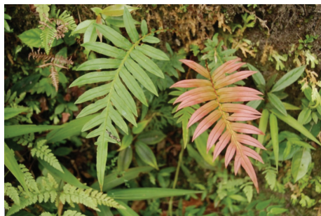
FIGURE 1: Photo of Blechnum orientale L. ( Kuan Chung in Chinese). The species was authenticated by Dr. Fa-guo Wang from Key Laboratory of Plant Resources Conservation and Sustainable Utilization, South China Botanical Garden, Chinese Academy of Sciences, Guangzhou, China. The species for this study was sampled in August 2010. The voucher specimen (voucher no. 01721757) has been kept in Chinese Virtual Herbarium, Chinese Academy of Sciences.

ferns have been consumed as edible plant and utilized as pharmaceutical species in China. The accumulation and/or the adsorption of toxic pollutants by medicinal ferns have not been intensively concerned up to date. The main objectives of this study were to (1) detect the degree to which B. orientale accumulated toxic metals and polycyclic aromatic hydrocarbons (PAHs) in a polluted environment and (2) investigate the transportation of heavy metals from roots to fronds of B. orientale .