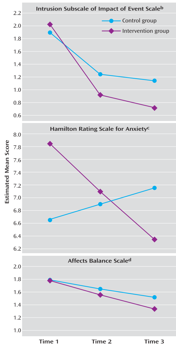
FIGURE 3. Change in Thought Intrusions, Clinician-Rated Anxiety, and Negative Affect Among Patients Undergoing Postsurgical Breast Cancer Treatment Randomly Assigned to a Stress Management Intervention or a Control Condition a

a For thought intrusions, time 3 was estimated as 7.02 months (to yield the best linear relation) rather than 12 months. Means incorporate all observed data and all data estimated using full information maximum likelihood procedures for missing assessments.