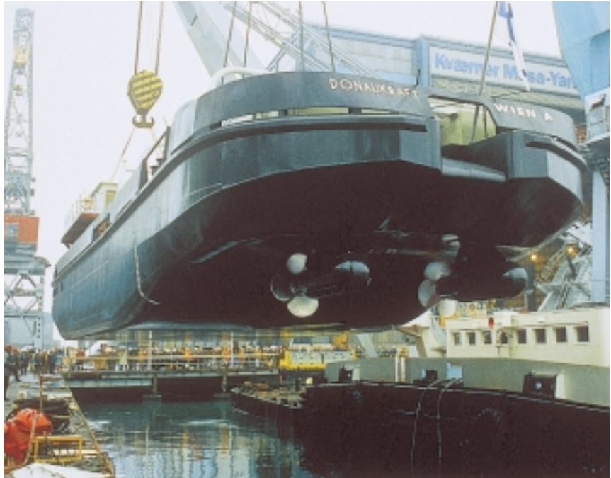
I/B Röthelstein. The two 560-kW units of this small river icebreaker are the first pulling-type Azipod units to be installed.

Carnival Cruise Lines (CCL) ordered its first Fantasy-class ships from the Kvaerner