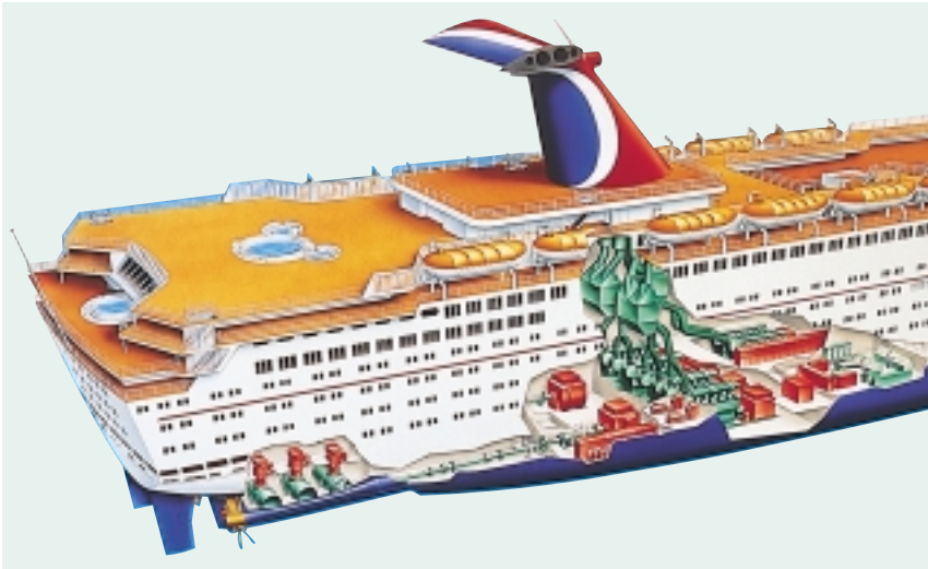
Conventional marine diesel-electric power plant and propulsion system 3

40,000, of which about 10,000 hours have been in ice-infested waters. In 1997 Uikku became the first western cargo ship to navigate the Northeast Passage. Uikku started its journey in Murmansk in western Russia at the beginning of September, arriving twelve days later in Providenya in eastern Siberia, south of the Bering Strait. The Uikku and the Lunni demonstrated the soundness of the basic design and construction chosen for the Azipod system.