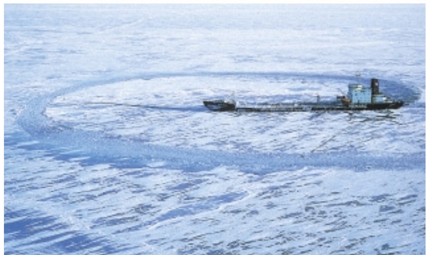
16,000-dwt product tanker M/T Uikku with an 11.4-MW Azipod unit during turning tests in half-meter thick ice 2

Norske Veritas) ice 10 class. In 1995 Uikku's sister ship, the M/T Lunni , was similarly converted. Both ships have been in heavy commercial use since conversion. Their combined operating hours total well over