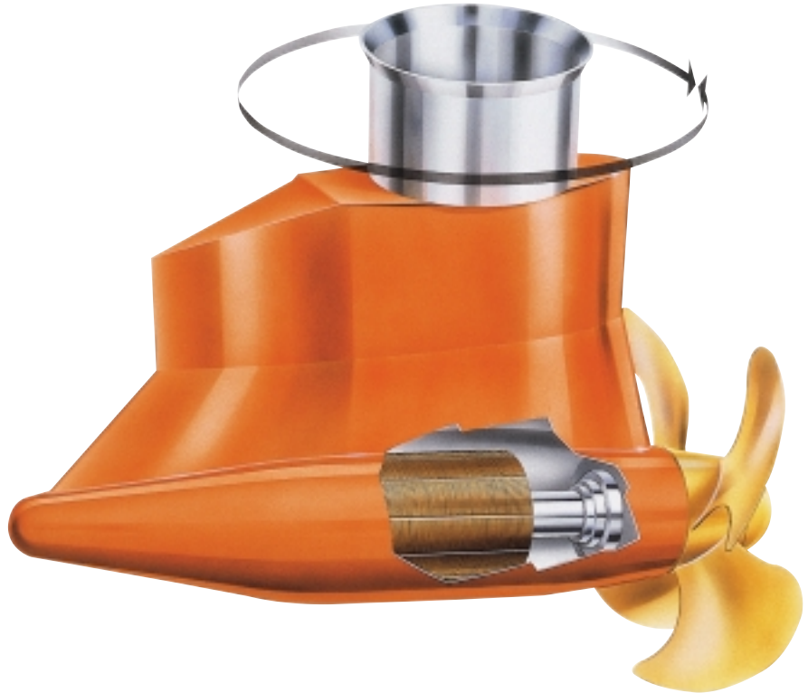
The Azipod® unit, in which an AC motor sits inside a submerged pod that can be freely steered through 360 degrees 1

The next ship to be equipped with the Azipod system was the 16,000-dwt product