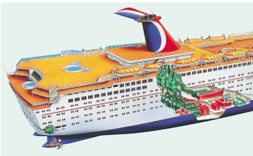
Azipod propulsion system and diesel-electric power plant. The Azipod system eliminates long shaft-lines, rudders, stern thrusters, controllable-pitch propellers and reduction gears. 4

surpasses all other technologies. It has also been tested with the Lunni . These tests showed that although the Lunni was not designed to operate stern-first in heavy ice, it was able to operate in the toughest conditions found in Finnish waters without ice-breaker assistance. Model and full-scale tests confirm that only 60% of the power needed when attacking the ice bow-first is needed for this mode of ice-breaking.