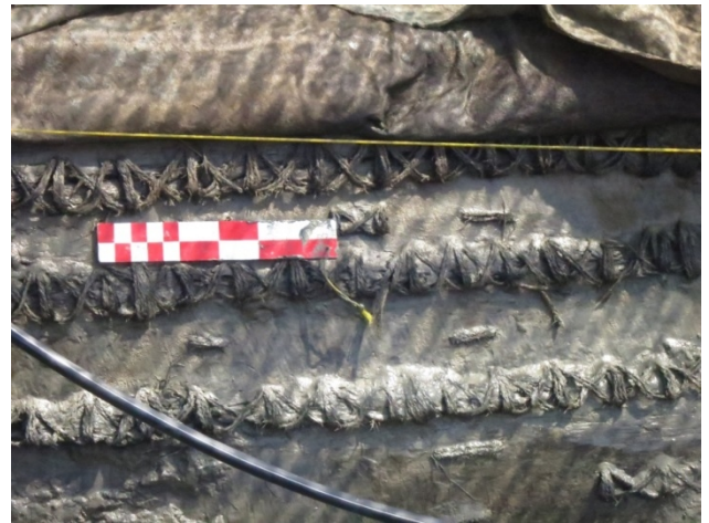
Figure 1: Picture of shipwreck planks sewn together.

are separate from that of stitched planks which are of the Southeast Asia Region (Mangiun 2013; see Figures 1 and 2). Stitched planks are a tradition ascribed to Southeast Asian manufacture based on archaeological evidence of twine in shipwrecks. Stitching fastens a plank to another plank by individual stitches with one discrete vertical line rather than continuous sewing (see Figure 2).