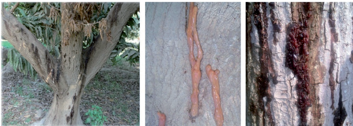
Figure 11. Gummosis (Lasiodiplodia theobromae).