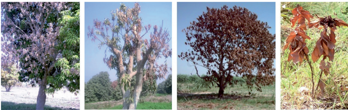
Figure 12. Mango sudden decline.