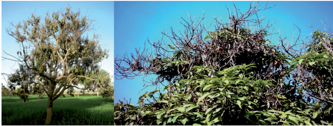
Figure 10. Dieback (Lasiodiplodia theobromae Pat.)