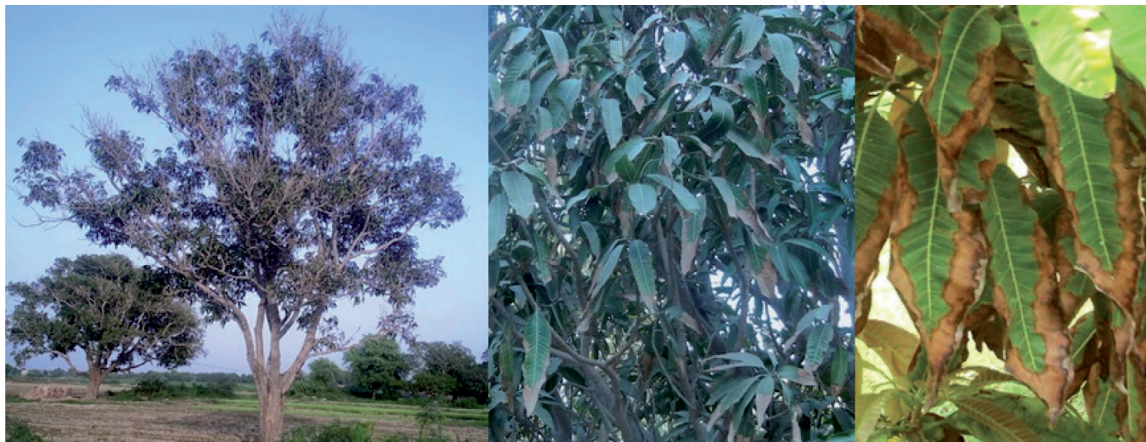
Figure 2. Anthracnose disease (Colletotrichum gloeosporioides Penz.).

Mango suffers from several infectious diseases caused by many phytopathogens. More than 83 different diseases and disorders including 52 fungal, 3 bacterial, and 3 plant-parasitic nematodes of the mango tree and fruit have been recorded worldwide which cause losses; however, fortunately no single disease is caused by the virus till now in mango [27, 28]. Twenty-seven diseases have been reported in mango trees of Pakistan [28]. Among them the main diseases are anthracnose, Colletotrichum gloeosporioides (Penz.) ( Figure 2 ); powdery mildew, Oidium mangiferae (Bert.) ( Figure 3 ); malformation, Fusarium spp. ( Figure 4 ); bacterial leaf spot, Erwinia mangiferae (Doidge) ( Figure 5 ); crown gall, Agrobacterium tumefaciens ( Figure 6 ); sooty mold, Capnodium mangiferae ( Figure 7 ); fruit rot, C. gloeosporioides and Aspergillus niger ( Figure 8 ); root rot, Rhizoctonia solani (Kuhn) and F. oxysporum (Schl.) ( Figure 9 );