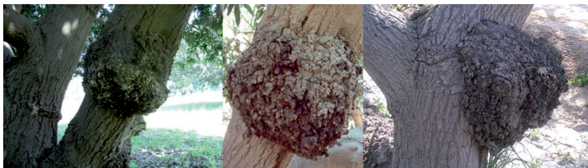
Figure 6. Crown gall (Agrobacterium tumefaciens).