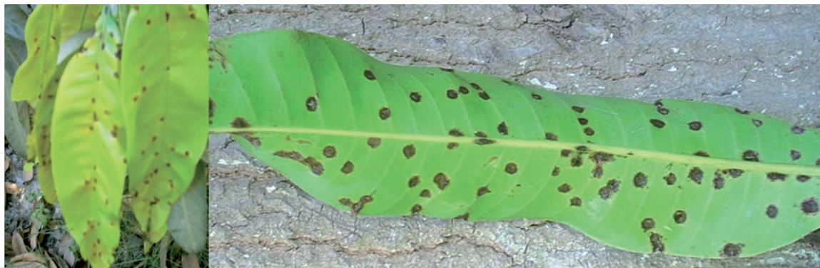
Figure 5. Bacterial leaf spot (Erwinia mangiferae Doidge).