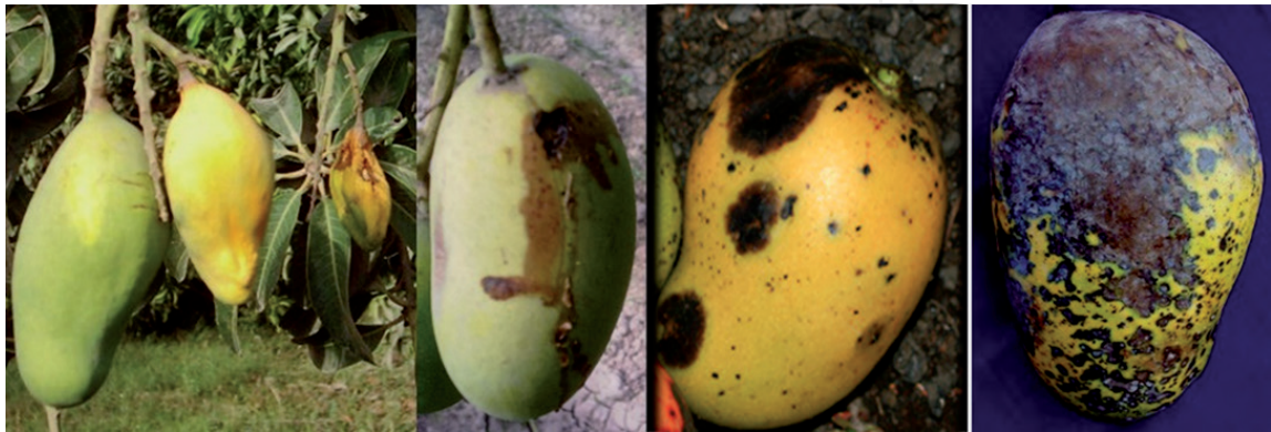
Figure 8. Fruit rot ( C. gloeosporioides and Aspergillus niger ).