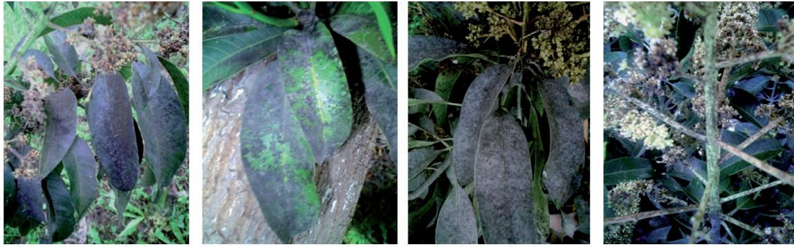
Figure 7. Sooty mold ( Capnodium mangiferae ).