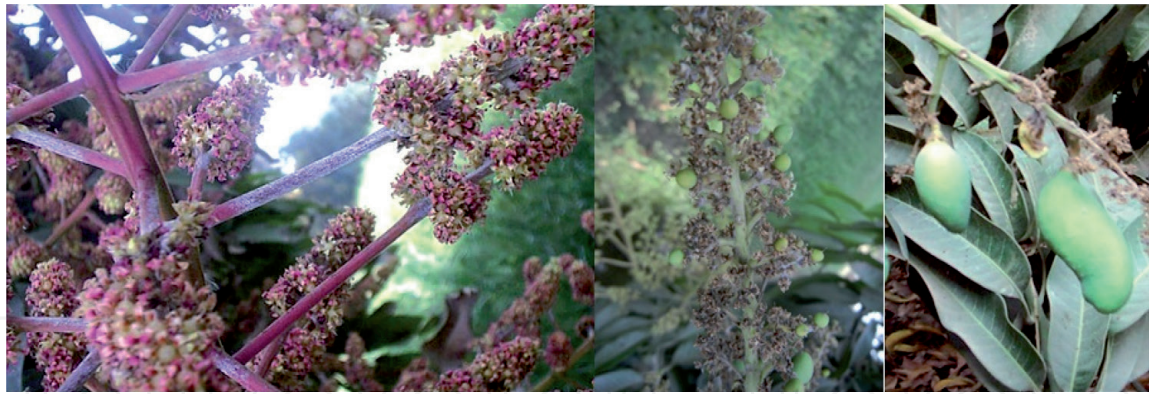
Figure 3. Powdery mildew disease (Oidium mangiferae Bert.).