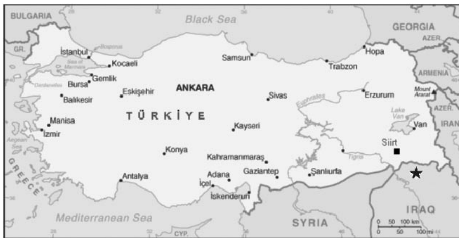
Figure 3. Distribution of Teucrium chasmophyticum from type locality (★) and Turkey (■).