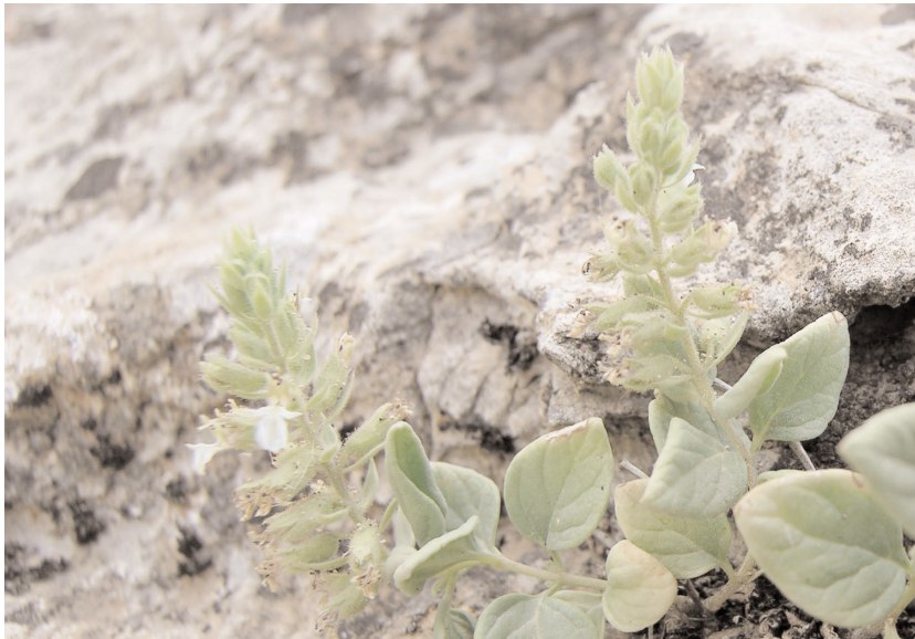
Figure 2. A view of Teucrium chasmophyticum on the limestone crevices.

The species is known as only a single specimen of the type gathering and the second location around Gölgelikonak village of Eruh-Siirt (Figure 3). The Turkish population of the taxon is found on the rock crevices of the area and it is not under considerable threat. In consideration of both localities, I propose the "CR" category (IUCN, 2001) for this chasmophytic taxon. The specimens of the taxon are kept at HUB.