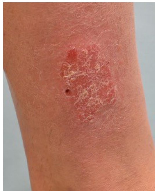
Figure 1 Plaque type psoriasis on lower extremity prior to treatment with excimer laser.

Bonis et al were the first to study the use of the 308 nm XeCl excimer laser in the field of dermatology in 1997. They investigated the use of excimer laser for treatment of 10 patients with chronic plaque psoriasis and concluded that it was an effective treatment option. 15 Since its initial introduction to dermatology, use of the excimer laser as a treatment option has expanded to applications in many dermatologic diseases. Psoriasis treatment with excimer laser has proven to be effective even in early studies with Feldman et al demonstrating 84% of patients achieving a 75% or better improvement after 10 or fewer treatments (Figures 1 and 2). Excimer laser is currently indicated for adult and pediatric patients with mild, moderate, or severe psoriasis with <10% body surface area involvement and the American Academy of Dermatology states the level of evidence is II and the strength of recommendation is B. A literature search on PubMed was used with combinations of the terms "excimer", "excimer