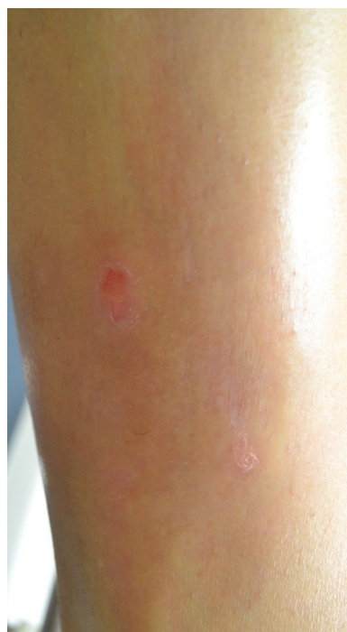
Figure 2 Plaque type psoriasis on lower extremity after eight treatments with excimer laser according to MED protocol.

Abbreviation: MED, minimal erythema dose.