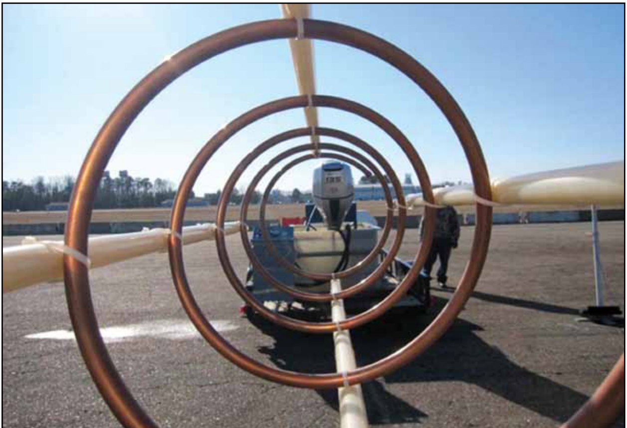
Figure 3. Small-Vessel Testing Using a High-Power Microwave Source