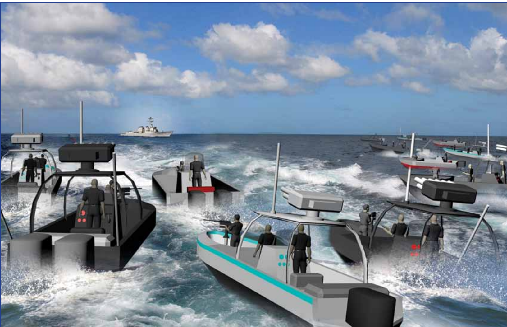
Figure 1. Depiction of a Small-Vessel Swarm Ready to Attack

Prop entanglement systems, exhaust stack blockers, and sea-anchor systems are useful and effective, but all are operationally difficult to deliver when deployment methods rely on positioning them in front of, or directly over, a vessel moving