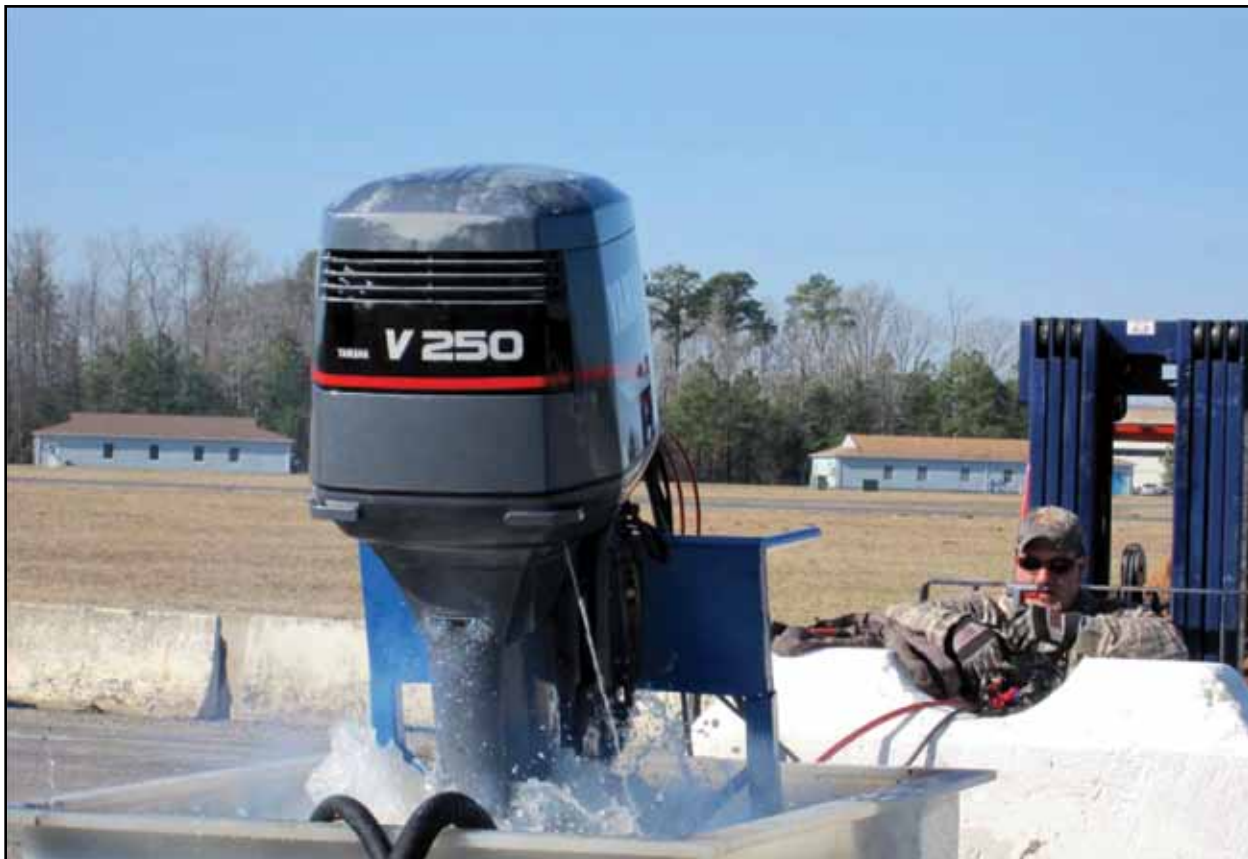
Figure 2. Outboard Motor Test Stand

NSWCDD's Directed Energy Division began HPM susceptibility testing to determine the effectiveness of HPM weapons against relevant outboard engines. This involves testing small vessels in