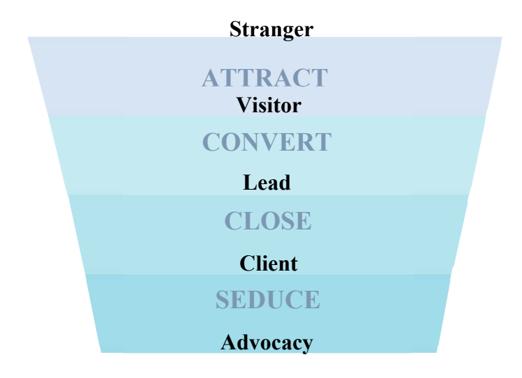
Figure 2. Conversion funnel.

This phase is especially important in the current global tourism crisis brought on by the COVID-19 pandemic [30]. It is essential to attract the tourist again, to generate confidence when choosing the destination and for that role the key lies with inbound marketing.