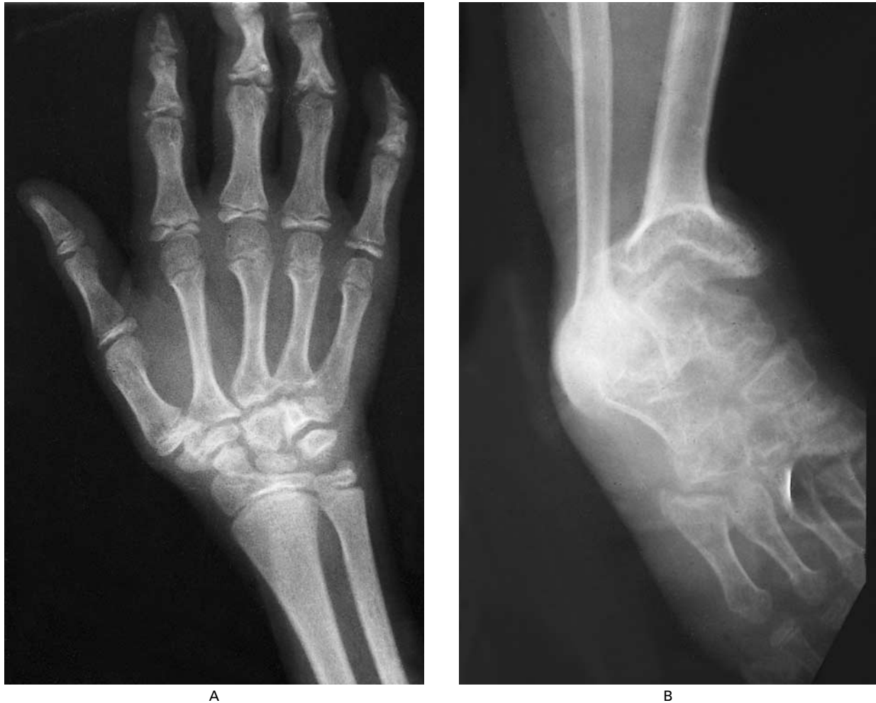
Figure 3. Radiographs of the Left Hand and Left Ankle of a 14-Year-Old Boy with Kashin–Beck Disease (Panels A and B) and of the Left Hand and Left Ankle of a Normal 14-Year-Old Tibetan Boy (Panels C and D, Facing Page).

The carpal bones of the boy with Kashin–Beck disease are small and irregular, the articular spaces are narrow, and the carpal length is reduced. The metacarpal bones are short, and their proximal ends are widened. The metaphyses of the phalanges are widened, and the middle phalanx is fragmented, with a cone-shaped epiphysis. The tarsal bones have an irregular, collapsed aspect, the tarsal length is decreased, and the metatarsal bones are shortened and have irregular proximal ends. The distal epiphysis of the tibia is cone-shaped, and there is premature closure of the metaphysis, with subsequent shortening of the tibia.