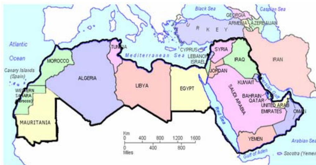
Figure 1. The geographical map of the Arab-Homeland.

advanced satellite communications technologies are discussed. The unified M-Learning model and the main components of the proposed IAESat are discussed in Section 3. Section 4 describes the operation procedure and lists the advantages of IAESat. Finally, in Section 5 conclusions and recommendations for future work are pointed-out.