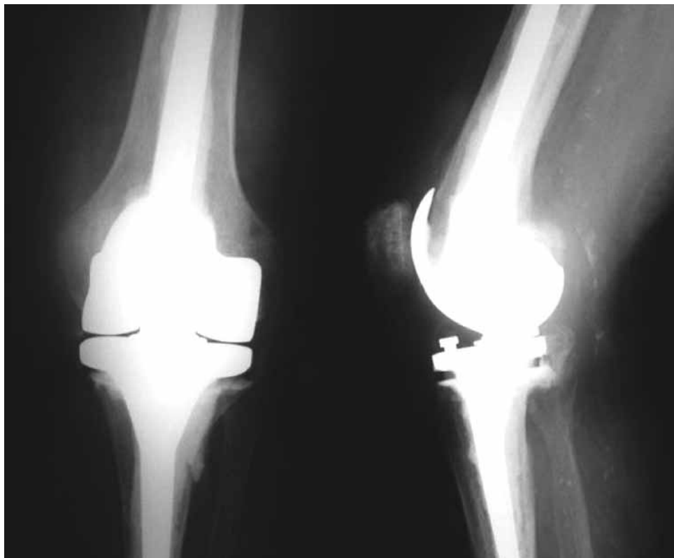
Fig. 2. — Postoperative radiograph demonstrating Waldemar Link Rotating Hinge TKR

fracture is an uncommon fracture especially in the elderly with a low-velocity injury. There were no preexisting symptoms in that knee. In view of the clinico-radiographic and operative findings, bone specimens were sent for histology but did not show obvious pathology. Retrospectively this specimen did show AFB which could have reached the fracture site at the time of or following the fracture. Radiographic findings of the chest on admission could have been as a result of a possible tuberculous affection in the past and the AFB could have been latent in the tibia and subsequently reactivated as a result of the trauma/surgery. Secondary contamination with coagulase negative staphylococcus further complicated the whole clinical picture and 'masked' the underlying tuberculous infection.