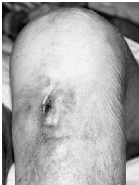
Fig. 3. — Chronic discharging tuberculous sinus over the knee

and this should be investigated in relevant cases (1).