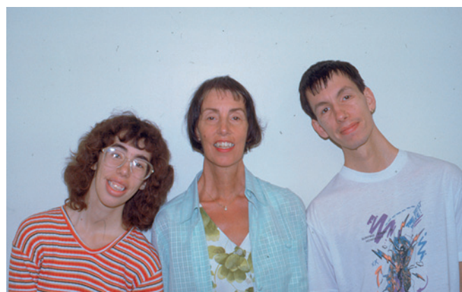
Figure 5 A mother with DM1 in centre (approximately 230 CTG repeats) with her affected daughter on the left (approximately 630 CTG repeats) and affected son (approximately 730 CTG repeats). The son and daughter have expanded repeats compared with their mother due to anticipation through the maternal line.

Myotonia may interfere with daily activities such as using tools, household equipment or doorknobs. Handgrip myotonia and strength may improve with repeated contractions—'warm up phenomenon'. 28 The warm up phenomenon can also improve