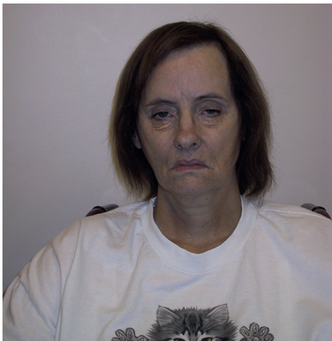
Figure 3 Typical facial appearance of severe adult onset myotonic dystrophy showing weakness and atrophy of the facial muscles, wasting of the temporalis and ptosis (approximately 530 CTG repeats).

enlargement are often present at birth. 18 19 Children with congenital DM1 are able to walk. Faecal soiling can be problematic. A progressive myopathy and the other features seen in the classical form of DM1 can develop although this does not start until early adulthood and usually progresses slowly. 20 Patients often develop severe problems from cardiorespiratory complications in their third and fourth decades.