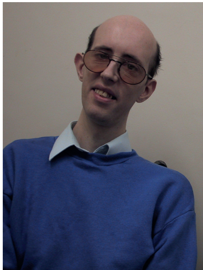
Figure 4 Patient is eldest son of patient in figure 3. He has congenital onset myotonic dystrophy and already shows similar features to his mother and frontal balding (approximately 1300 CTG repeats). Unfortunately, his younger brother (approximately 1500 CTG repeats) died suddenly and this was presumed to be secondary to a malignant cardiac arrhythmia.

The predominant symptom in classic DM 1 is distal muscle weakness, leading to difficulty with performing tasks requiring fine dexterity of the hands and foot drop, particularly affecting ankle dorsiflexors. The characteristic facies is caused by weakness and wasting of the facial, levator palpebrae and masticatory muscles giving rise to ptosis and the typical myopathic or 'hatchet' appearance (figures 3–5). The neck flexors and finger/wrist flexors are also commonly involved. Ophthalmoplegia is described but is rare. Muscle weakness progresses slowly. An axonal peripheral neuropathy may add to the weakness. 23