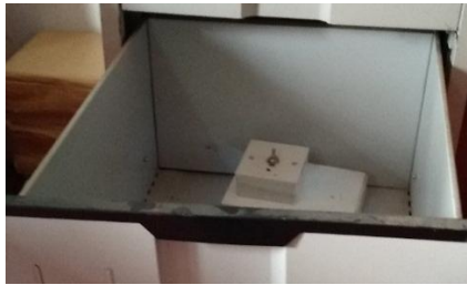
Figure 4. Metal pigeonhole

Figure 4 shows the implementation of the sensor module using metal pigeonhole.