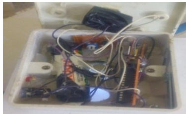
Figure 2. Sensor Module

The sensor module consists of several hardware components that work together to ensure the smooth running of the system. Figure 2 shows the sensor module as follows: