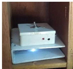
Figure 3. wooden pigeonhole implementation

Figure 3 shows the implementation of the sensor module using a wooden pigeonhole.