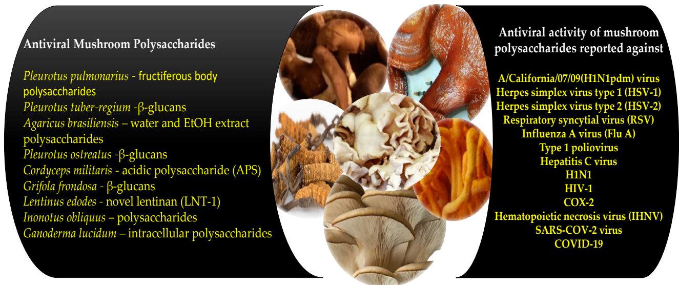
Figure 2. Overview of antiviral mushroom polysaccharides and impacted viruses.

The three mushrooms Pleurotus columbinus , Pleurotus sajor-caju , and Agaricus bisporus contain a myriad of bioactive compounds. Aqueous extracts of these mushrooms were tested against Ad7 and HSV2 viruses. The extracts show potent antioxidant effects. Pleurotus columbinus , Pleurotus sajor-caju and Agaricus bisporus mushrooms offer significant medicinal potential for the prohibition and treatment of a variety of ailments [308]. Figure 2 gives an overview of the comprehensive list of viruses and the mushroom polysaccharides that have been reported to engage in antiviral activity.