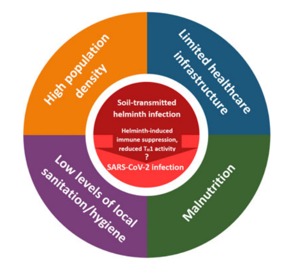
Figure 3. Structural, population-level factors associated with an increased risk for both STH and SARS-CoV-2 infection. These structural factors interact and reinforce one another, contributing to rapid disease spread, increased infection susceptibility, few treatment options, and general poor health. It is expected that STH and SARS-CoV-2 infection risk are both negatively affected by these socio-ecological factors. These two infection types are also hypothesized to interact, such that the immunosuppressive effects of STH infection may increase the risk of initial SARS-CoV-2 infection and make it more difficult to fight off infection

While we hypothesize that coinfection with STHs and SARS-CoV-2 may reduce the risk of severe inflammatory COVID-19, it is important to consider other factors associated with both infection types that may also affect disease outcomes. For instance, STHs tend to be most common in low-income countries that already experience high infectious disease burdens due to limited access to medical care or infrastructure that protects from infection. Thus, variation in disease exposure and subsequent immune activity is likely due to a mix of factors, including individual immune system development (as discussed above), but also local conditions (Fig 3; e.g. population density, healthcare access, sanitation levels, etc.) [83, 89–93]. These interwoven effects may be difficult to disentangle and