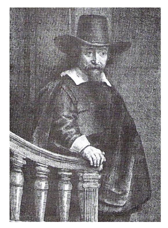
Figure 1. Rembrandt's etching of Dr Ephraim Bueno, 1647 (in public domain).

There is firstly an etching of 1647, Dr Bueno Descending the Stairs , where he is shown in well-to-