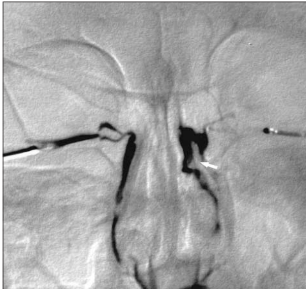
Figure 5. Patient's left side, The nasolacrimal ostium positioned at the middle part of the sac. The middle concha (arrow) appears to be medial to the lower part of ostium. The contrast medium is delineating the contour of the middle concha. Patient's right side, The contrast medium is passing freely to the nasal cavity.

previously thought, and it may not cause a problem if the final ostium is large enough and functional.