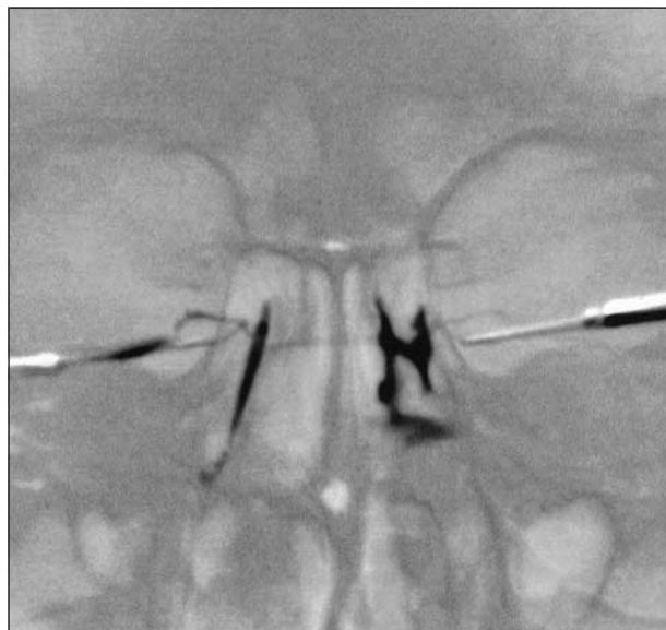
Figure 3. The early phase of postoperative dacryocystography. Patient's left side, The nasolacrimal ostium is located at the middle part of the lacrimal sac. Patient's right side, The contrast medium filling the sac.

tients (7%) ( Figure 3 ). In 1 patient (2%), the sac had not re-formed, and the contrast medium drained through a fistulous tract into the nasal cavity ( Figure 4 ).