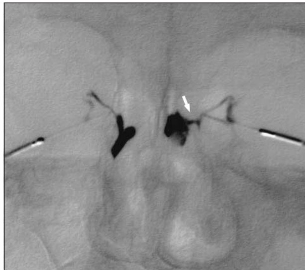
Figure 4. Patient's left side, No regeneration of the sac occurred after external dacryocystorhinostomy. A fistulous tract (arrow) connects the common canaliculus to the nasal cavity. Patient's right side, The nasolacrimal ostium appears at the inferior part of the regenerated sac.