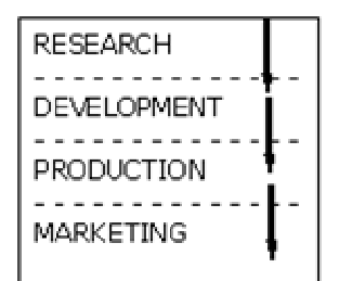
FIGURE 1 The conventional "linear model" of the linkage of research to production.

Bible. A sketch of this model is given in Figure 1. The linear model distorts the reality of innovation in several ways, and most serious students of innovation have now come to recognize those distortions. However, improved models have not yet come into widespread use. Consequently, the linear model is still often invoked in current discussions, particularly in political discussions. This continued use should not surprise us, since, as Thomas Kuhn (1967) has argued, we do not abandon a model for thinking about a complex situation until we have a better model to put in its place.