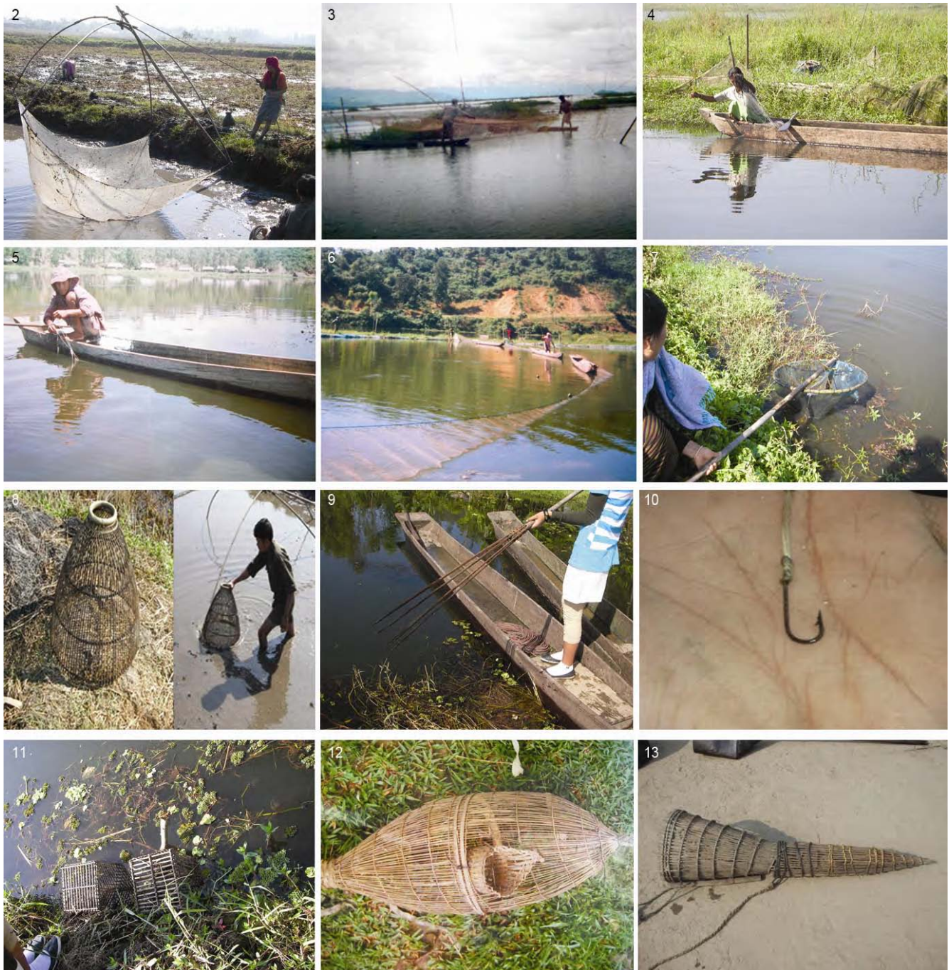
Figs. 2-13—Operation of Nupi-il ; 3—Operation of il-Jao in lake; 4—Setting of Lang ; 5—Setting of Lang ; 6—Moirang lang /Encircling net; 7—Operation of longtharai ; 8—Plunge cover basket and its operation; 9—Long/spear fishing; 10— Khoi -Hook used for pole line; 11—Setting of bamboo basket trap; 12— Kaba-lu /tubular trap; 13— Sora-l —Table 1-Particulars about the fishing methods in central valley region of Manipur India