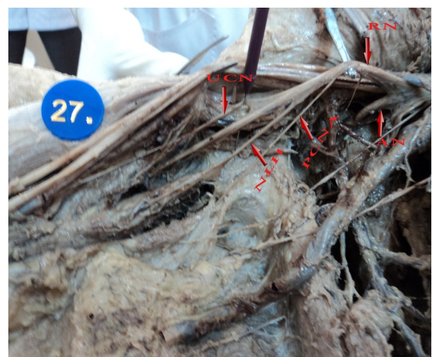
Fig. 1: Radial nerve branches in axilla and lower triangular space(LTS).

Ulnar collateral nerve(UCN) taking origin at LTS.( RN:Radial nerve, AN: Axillary nerve, PCNA:Posterior cutaneous nerve of arm, NLH:Nerve to long head of tricep)