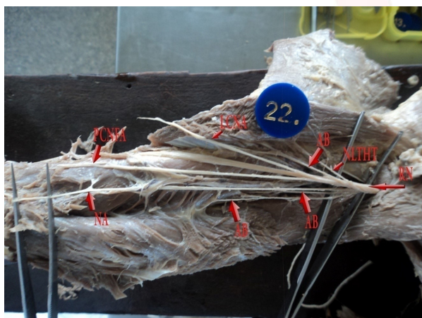
Fig. 4: Radial nerve branches in Posterior compartment of arm.

Additional branches (AB) to medial head of tricep from Radial nerve(RN) (NLHT:Nerve to lateral head of tricep, NA: Nerve to medial head of tricep & anconeus,LCNA: Lower lateral cutaneous nerve of arm,PCFNA:Posterior cutaneous nerve of forearm)