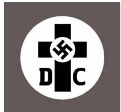
Figure 3. The flag of the ‘German Christians’ (Deutsche Christen) movement. It was the institutional face of the Positive Christian heresy which Hitler advocated—it rejected most of the biblical canon, it denied Jesus’ Jewishness, and it emphasized ethics at the expense of doctrine.

In chapters 9–12, Holding addresses a number of associated concerns and objections to his main thesis. In chapter 9 he identifies and discusses a number of sources for Hitler’s religious beliefs that historians have for various reasons deemed questionable. Much of what he discusses is used as ‘smoking gun’ proof of Hitler’s hostility to Christianity. Different sources pose different concerns—some have questionable objectivity, reliability, or even accessibility to Hitler. However, they paint a picture little different from what can be gleaned from sources