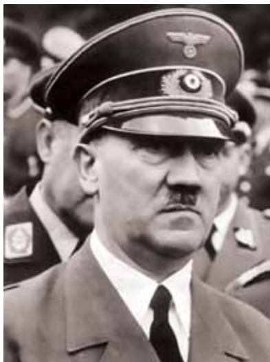
Figure 1. Hitler was not an atheist, occultist, or orthodox Christian; he was a heretic.