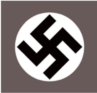
Figure 2. The swastika was not a symbol used by the Nazis to illustrate their link with the occult; they used it as a symbol of the superiority of the Aryan race. As Hitler said in Mein Kampf : “And the swastika signified the mission allotted to us—the struggle for the victory of Aryan mankind and at the same time the triumph of the ideal of creative work which is in itself and always will be anti-Semitic.”

were essentially the institutional face of Positive Christianity in the Protestant churches (figure 3), and they were able to dominate most of the theological schools in Germany by the mid-1930s. German Catholicism showed some meagre opposition to the Nazis, mostly in the early years of Nazi rule. The response from non-German Catholics was in general more strident, and