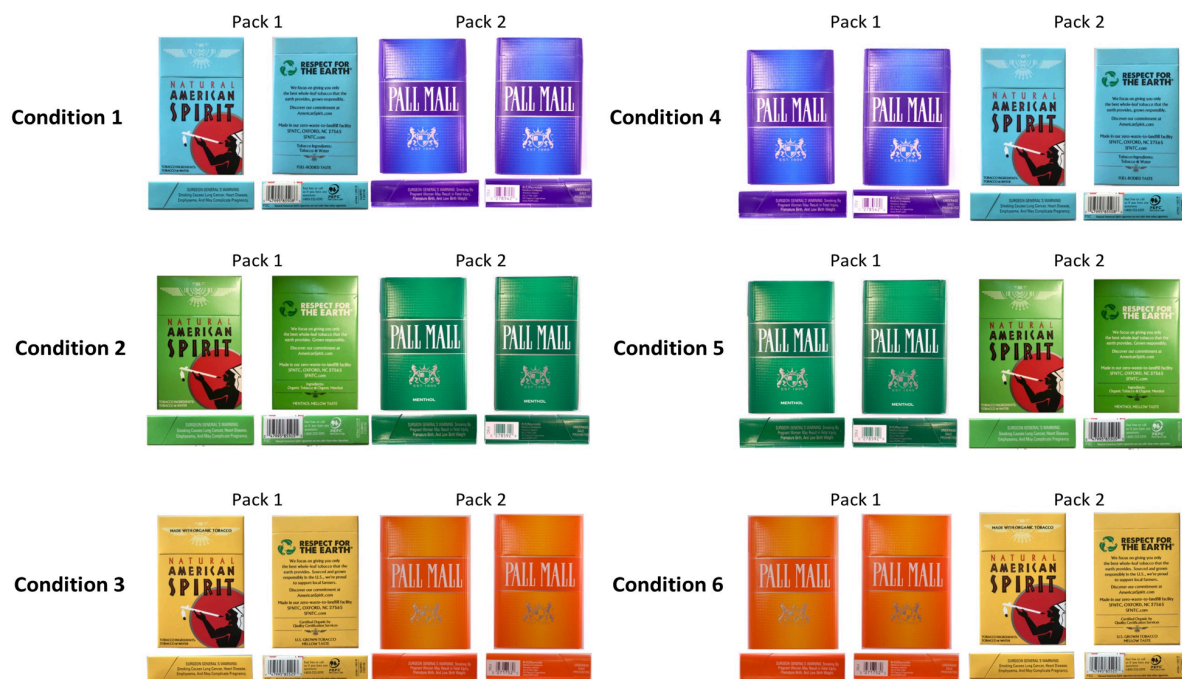
Figure 1 Cigarette Pack Images Viewed by Participants