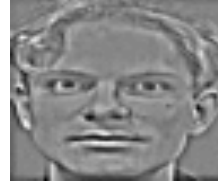
(b) Preprocessed input image.