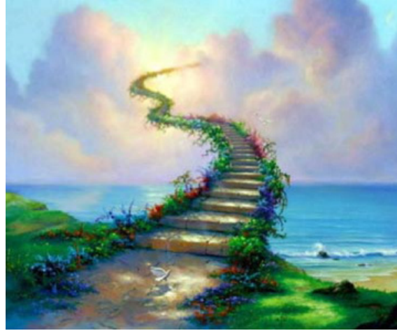
Figure 7. A picture of the rainbow bridge [20].

At the same time, the “rainbow bridge” concept occasionally crops up in Norway as well, but the concepts of feline heaven and angelic existence after death are more common in Sweden. In Norway, by contrast, the spiritual dimension conveyed by pictorial symbols and texts is much more pronounced on human graves (See above).