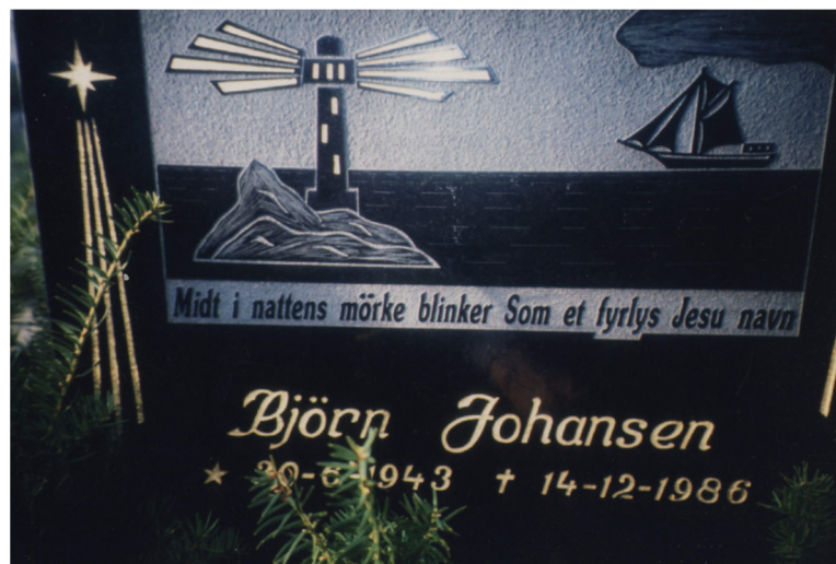
Figure 3. A maritime design showing a ship at sea together with a lighthouse and the Christian inscription, “In the gloom of night Jesus’ name shines out like a lighthouse”. There is also a shining star to the left. Gravestone for a forty-three-year-old man at Vestre Gravlund cemetery, Oslo, 1986.

In Norway, worldly pictorial symbols on gravestones are fairly often combined with Christian symbols or epitaphs, which seems to reflect a greater degree of religious consciousness. The symbol of a boat or ship, which in Sweden stands for occupational or leisure time interests, in Norway may be combined with a religious inscription in which life is presented as a voyage. Eternity is then a shore on the far side of the sea. The darkness of death is illuminated by Jesus' name (Figure 3). An anchor or flowers entwined with a cross can also show the merging of the sacred and the worldly.