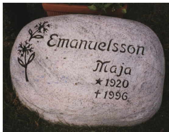
Figure 2. A woman's name inscribed to the right in 1996, with the space on the left preserved for her surviving husband's name. This crematory urn gravestone, decorated with a woodbine, a flower of the Bohuslän province in Sweden, is located in the cemetery in the coastal village of Hunnebostrand.

In Norway the reuse of old gravestones is quite common, but it has been unusual in Sweden until the present time. Before being reused, the stone surface is ground smooth, and new inscriptions and