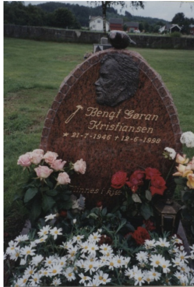
Figure 1. A bronze portrait fastened to the front of a gravestone erected in memory of a fifty-two-year-old carpenter in 1998 in Idd cemetery, Norway. A bronze bird has been set on the top of the stone. The hammer symbolizing a craft is very rare in Norway. Text: “Remembered with love”.

under that of the first deceased, in other words, in the secondary position. Sweden appears to have been more tradition-bound in this respect during the latter part of the 1900s. Previously, however, the man's name was placed uppermost even in Norway. One may presume that the equality debate, which has long dominated the public sphere in Norway, could have contributed to the fact that social customs were discontinued in this country much earlier than in Sweden.