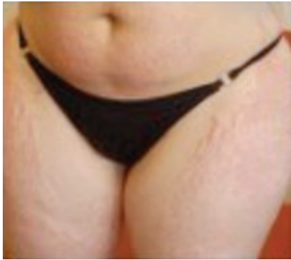
Figure 1. Erythematous papules and urticarial plaques with periumbilical sparing and accentuation in striae in a 21-year old woman with polymorphic eruption of pregnancy.