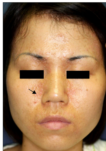
Fig. 1. Multiple skin colored or somewhat erythematous papules on the forehead, eyelids and areas along paranasal and nasolabial folds. The facial skin looked greasy (the arrow indicates the biopsy site).

Physical examination revealed multiple skin colored or