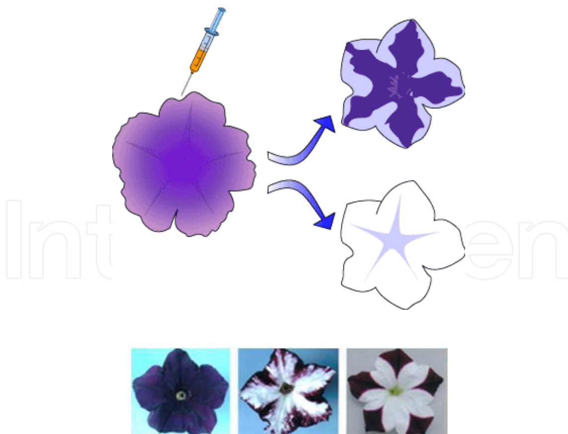
Fig. 1. Upon injection of the transgene responsible for purple colouring in Petunias , the flowers became variegated or white rather than deeper purple as was expected.

The discovery of RNAi was preceded first by observations of transcriptional inhibition by antisense RNA expressed in transgenic plants and more directly by reports of unexpected outcomes in experiments performed in 1990s . In an attempt to produce more intense purple coloured Petunias , researchers introduced additional copies of a transgene encoding chalcone synthase (a key enzyme for flower pigmentation). However, they were surprised at the result that instead of a darker flower, the Petunias were either variegated or completely white (Figure 1). They called this phenomenon co-suppression of gene expression (Napoli et al., 1990), since both the expression of the existing gene (the initial purple colour) and the introduced gene /transgene (to deepen the purple) were suppressed. It was subsequently reported by Christine, 2008 that suppression of gene activity could take place at the transcriptional level (transcriptional gene silencing, TGS) or at the posttranscriptional level (posttranscriptional gene silencing, PTGS).