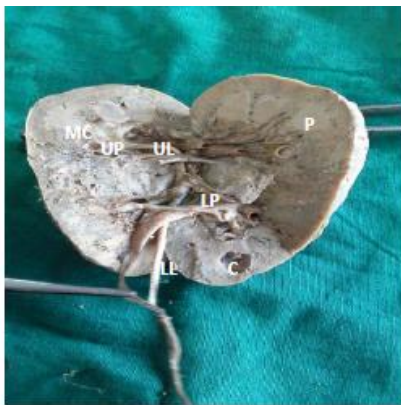
Figure-3 Coronal section of Right Kidney showing Duplex pelvicalceal system: UL-upper limb, UP-upper pelvis, MC-major calyx, LL-lower limb, LP-lower pelvis, P-pyramid, C-cyst