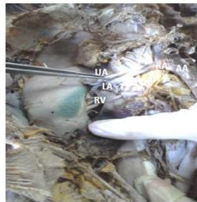
Figure-4 Structures at Right hilum-Anterior view: AA-Abdominal aorta, RA-Renal artery dividing into Upper Anterior (UA) branch and Lower Anterior (LA)branch, Renal vein