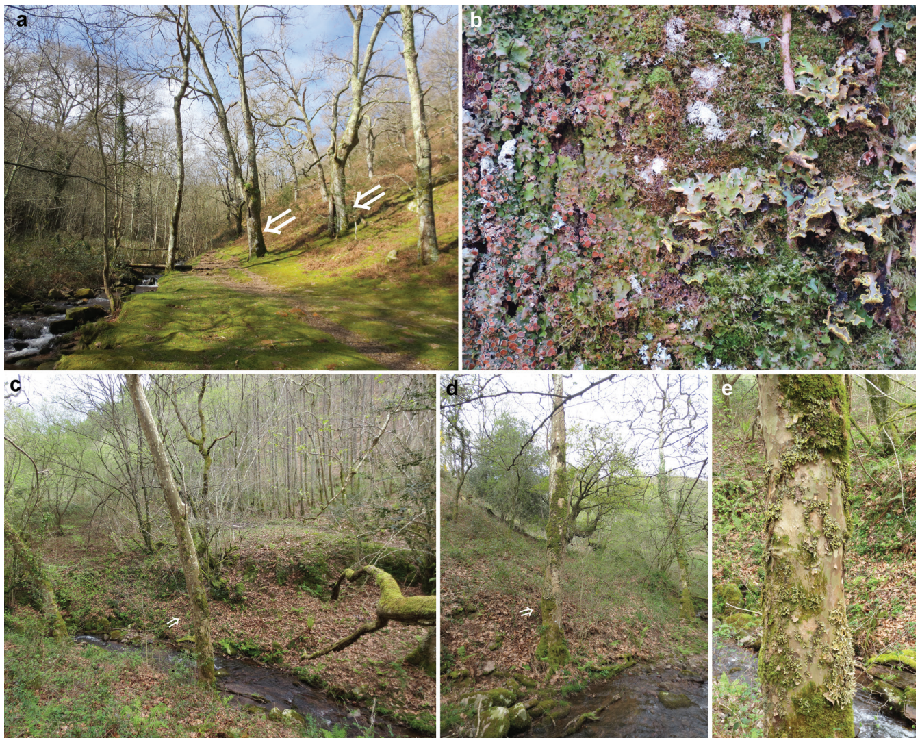
Fig. 4. Population Intzola, Navarra: a , Trees where Pseudocyphellaria aurata was located in Intzola 1 subpopulation; b , Thalli of P. aurata growing together with Ricassolia virens in subpopulation Intzola 1; c , Tree where P. aurata grew in subpopulation Intzola 2; d , Same tree from another perspective; e , Close-up showing thalli of P. aurata growing on loose bark of Platanus hispanica . Arrows indicate trees on which thalli of P. aurata grew.

9. Lekeitio (Biscay). Jovet (1941), apparently after a communication by P. Allorge, indicated that Pseudocyphellaria aurata was found “sur des Quercus dans des ravins maritimes accidentés à 25 m. de la mer, 1933”. Regrettably, no herbarium specimen supports this finding. This is a botanically remarkable locality because of the presence of rich stands of Woodwardia radicans and Stegnogramma pozoi (Lag.) K.Iwats. (Allorge & Allorge 1941), which are associated to warm hyperoceanic climates. Etayo (2009) visited this locality and could not find P. aurata there. Recently, we visited all the ravines that had forest in 1945 (Egurbideko erreka, Portuko erreka, Burgañeko erreka) covering the area between Lekeitio and Ondarroa, where P. Allorge and V. Allorge have made collections. At present, those ravines present patches of rather degraded forest with few mature oak trees, where we could not find P. aurata or any species of the Lobarion communities. We consider the