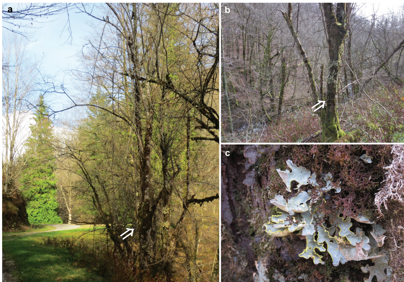
Fig. 3. Subpopulation Bertiz 1, Navarra: a , Tree where Pseudocyphellaria aurata was located; b , Same tree from the opposite perspective; c , Sorediate thalli of P. aurata . Arrows indicate the spot where thalli of P. aurata grew.

thalli of Lobaria pulmonaria (Fig. 4c-d) stand out. One of these trees hosts c. 64 thalli of Pseudocyphellaria aurata . A few more thalli were found on the ground around the tree base, attached to detached bark pieces. Accompanying species were: Lobaria pulmonaria , Ricasolia virens , Nephroma laevigatum , Brachythecium sp., Eurhynchium praelongum (Hedw.) Schimp., Metzgeria furcata , Isothecium myosuroides Brid., and Neckera complanata (Hedw.) Huebener.