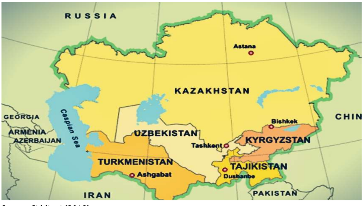
Figure 1. Map of Central Asian Countries<sup>2</sup>

Mackinder argued who controls this area, accumulates the tremendous power in its hands on the chessboard enabling to control the entire world.